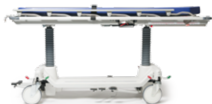
slides 6 inches (19 cm)