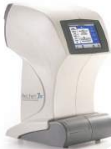
Reichert 7CR Auto Tonometer + Corneal Response Technology