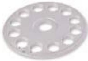
Precision machined, industrial strength aluminum lens dials