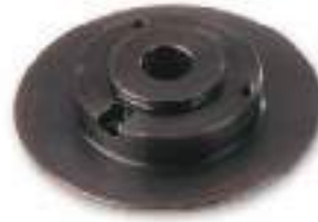
Heavy duty, precision bearing races